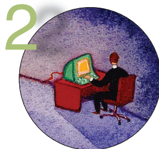
User types PKC into Case CATalyst