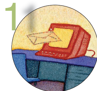
PKC arrives via e-mail