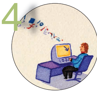
License server registers computer and returns activation to Case CATalyst