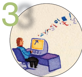
Case CATalyst sends an activation request to the license server